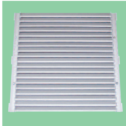
Core only no frame

The standard colour finish is silver stove enamel RAL9006 or white stove enamel RAL9010, other colours are also available to special order.