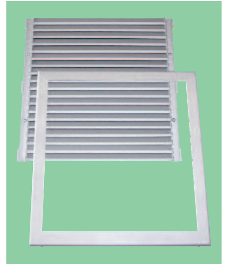
Front frame removed